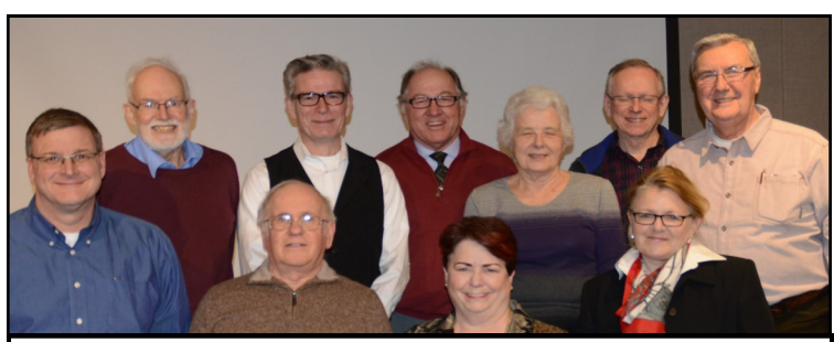
2015 Kingston Historical Society Council

Graveside Ceremony in Cataraqui Cemetery, 1.30 p.m.