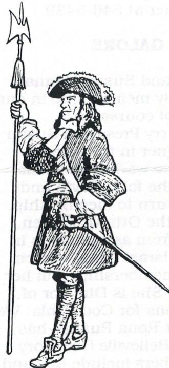
A French Carignan-Saliers soldier 1665