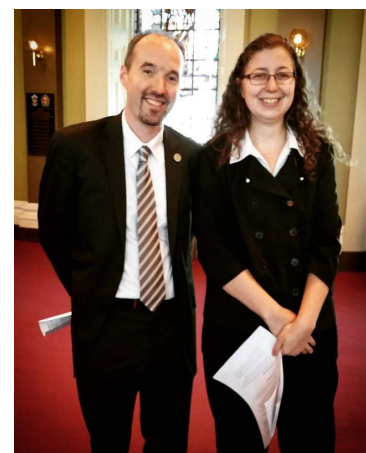
Photo featuring Mayor of Kingston from a past Heritage Fund Ceremony.

We are thrilled to announce that our museum applied for and was selected by a community jury to receive a grant from Kingston's Heritage Fund to continue museum operations for the year 2021. Five museums were helped this cycle by the Heritage Fund and it is an absolutely vital support to keep museums alive and accessible in our community to enrich the quality of life of our people and support local tourism. If you are a Kingstonian who appreciates having local museums, please be sure to thank your city councillor for the Heritage Fund!