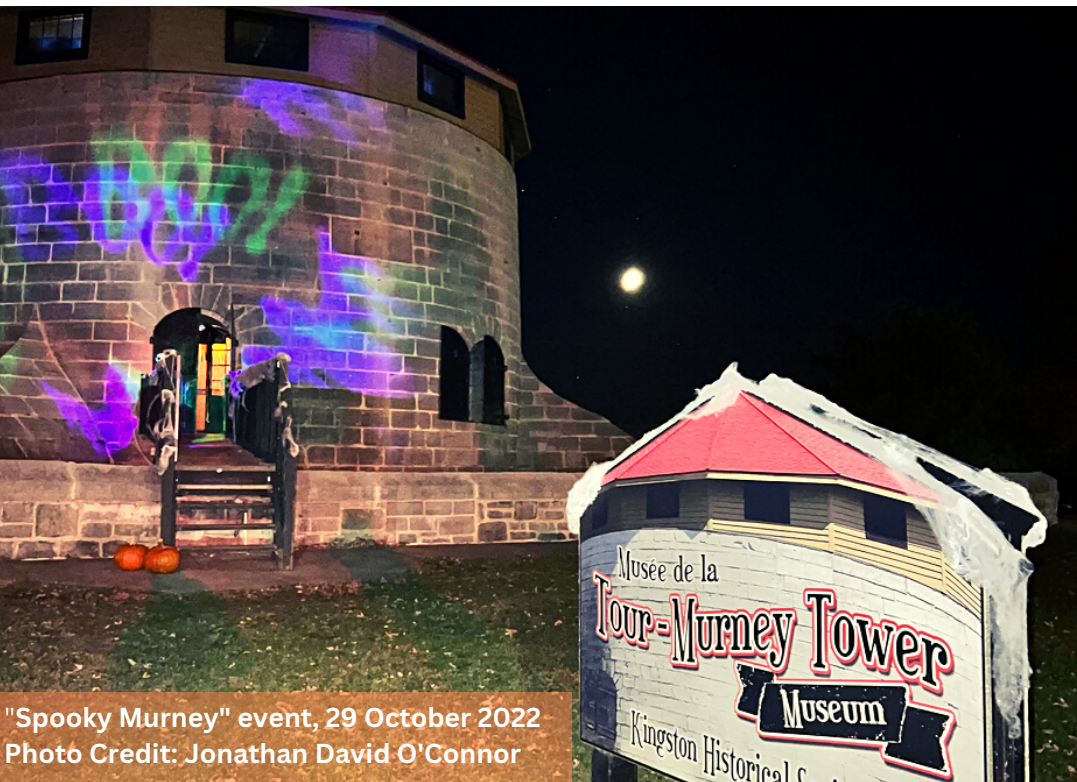
"Spooky Murney" event, 29 October 2022