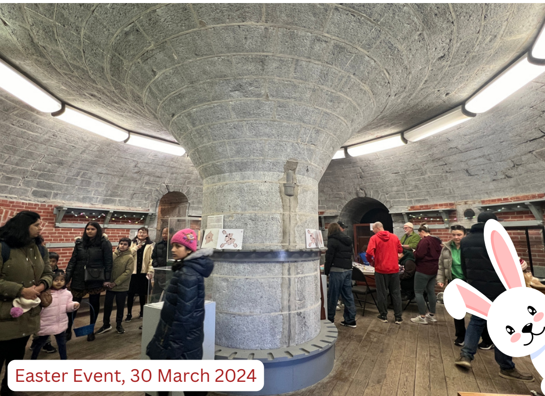
Easter Event, 30 March 2024